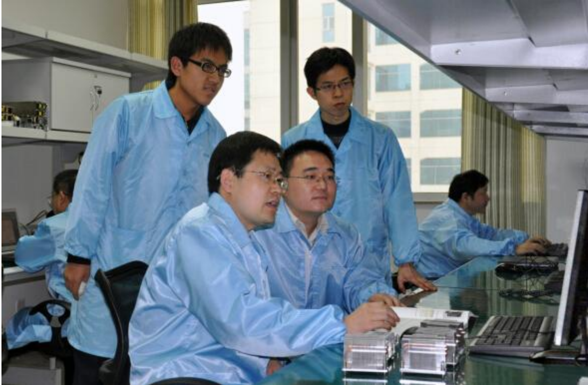
Our R&D team at work, ensuring precise development and rigorous testing for all custom projects.