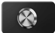
Press out: Suitable for tesla model 2017/2018/2019 3/x/s/y