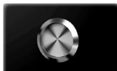
Press in: Suitable for tesla model 2020/2021 3/x/s/y